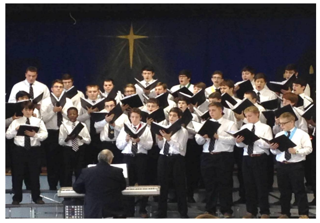
Choristers in "Run-out" Uniform