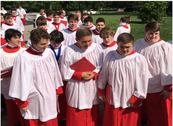
Choristers in Liturgical Uniform

This uniform consists of red or black cassock, surplice and ruff and is supplied by the school. These vestments are paid for by and kept at the school. This uniform is ordinarily worn when the choristers are functioning as a liturgical choir.